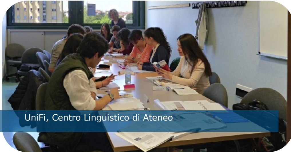
UniFi, Centro Linguistico di Ateneo

Language Courses: 30 hours courses for groups of about 18 people arranged in cycles.