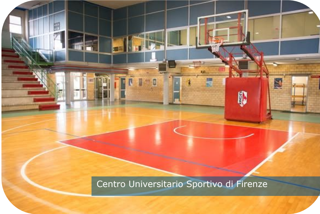
Centro Universitario Sportivo di Firenze

Basket Volleyball Swimming Pilates Yoga Gym and Fitness