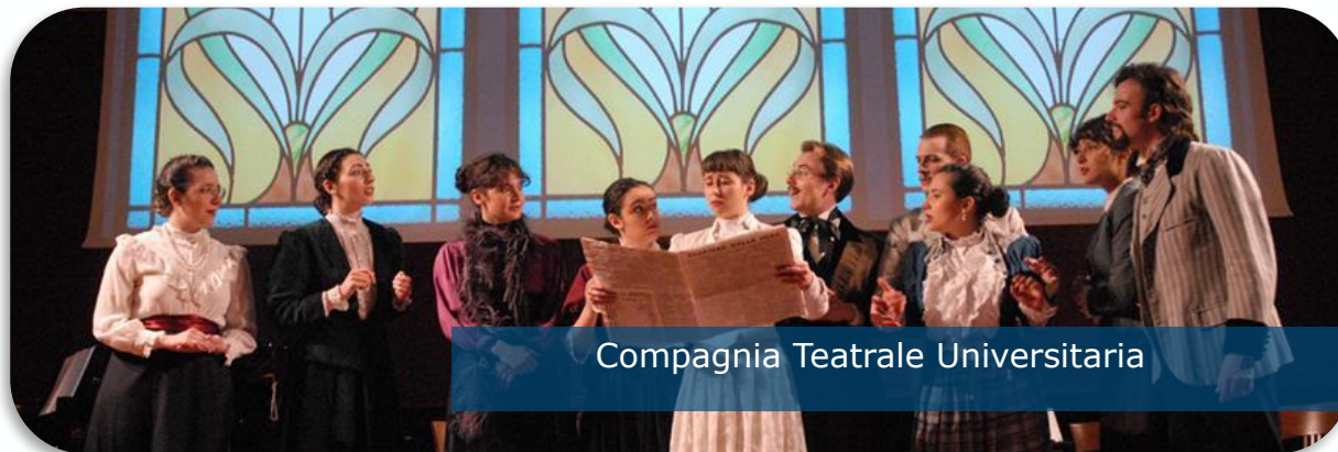
Compagnia Teatrale Universitaria

All Unifi students can freely join the theatre company, orchestra and choir, which represent an important cultural heritage and central part of the academic community.